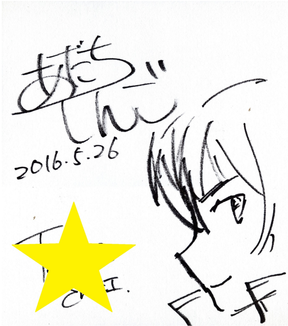
Shikishi by: Adachi Shingo - Acquired at Animazement 2016 - Kirito (SAO) - Sword Art Online