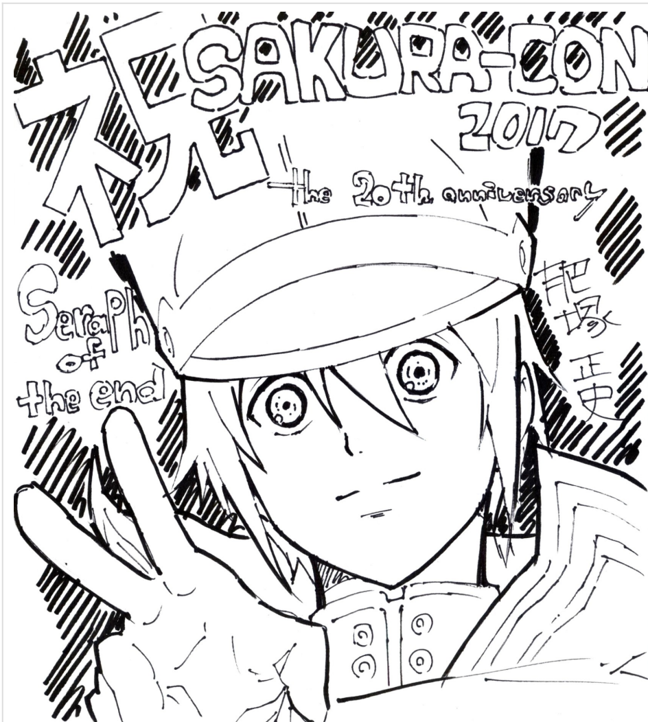
Koizuka Masashi - Sketch from Seraph of the End - Sakuracon 2017 Charity Auction Sketch (Charity - Make A Wish Foundation)