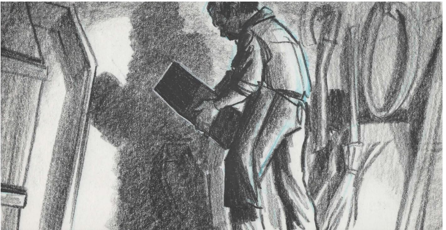
A storyboard from the film Balto. (Original)