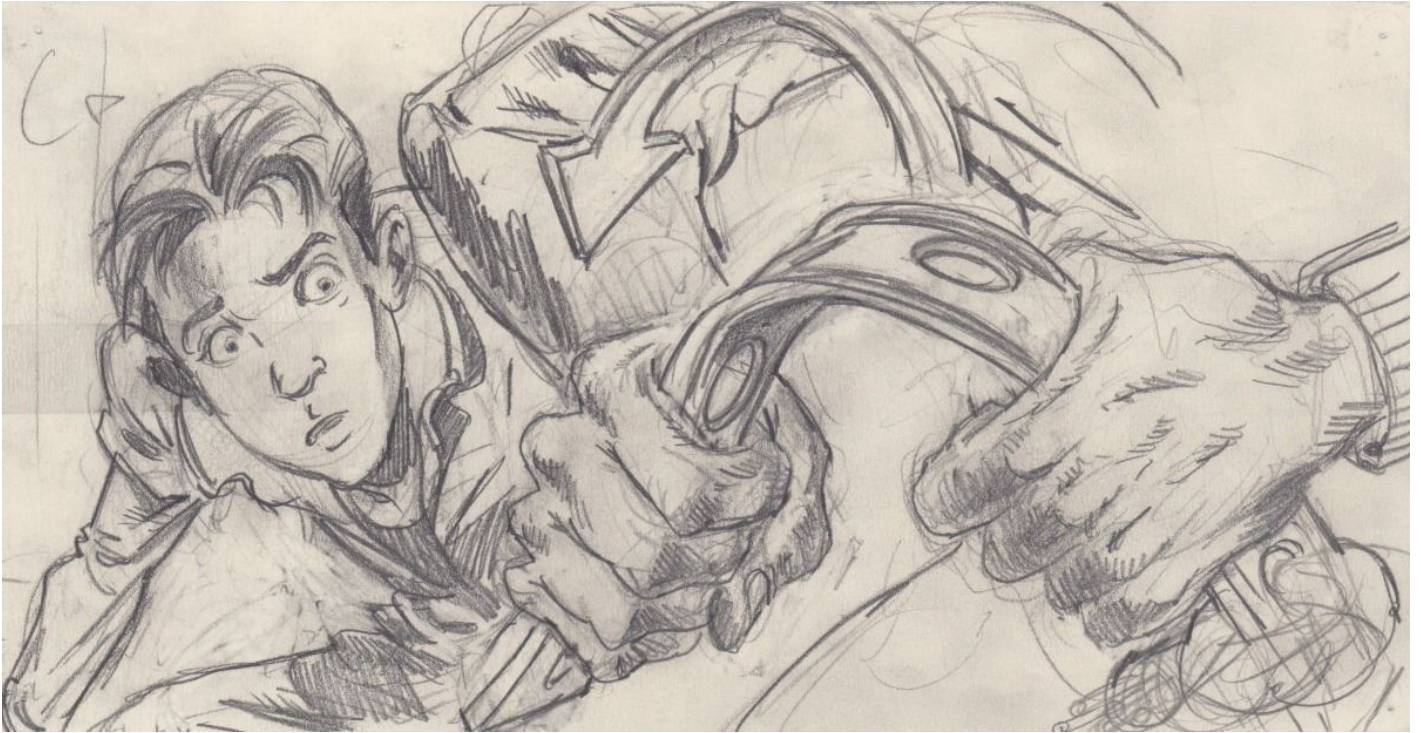
A storyboard from the film Titan A.E. (Original)