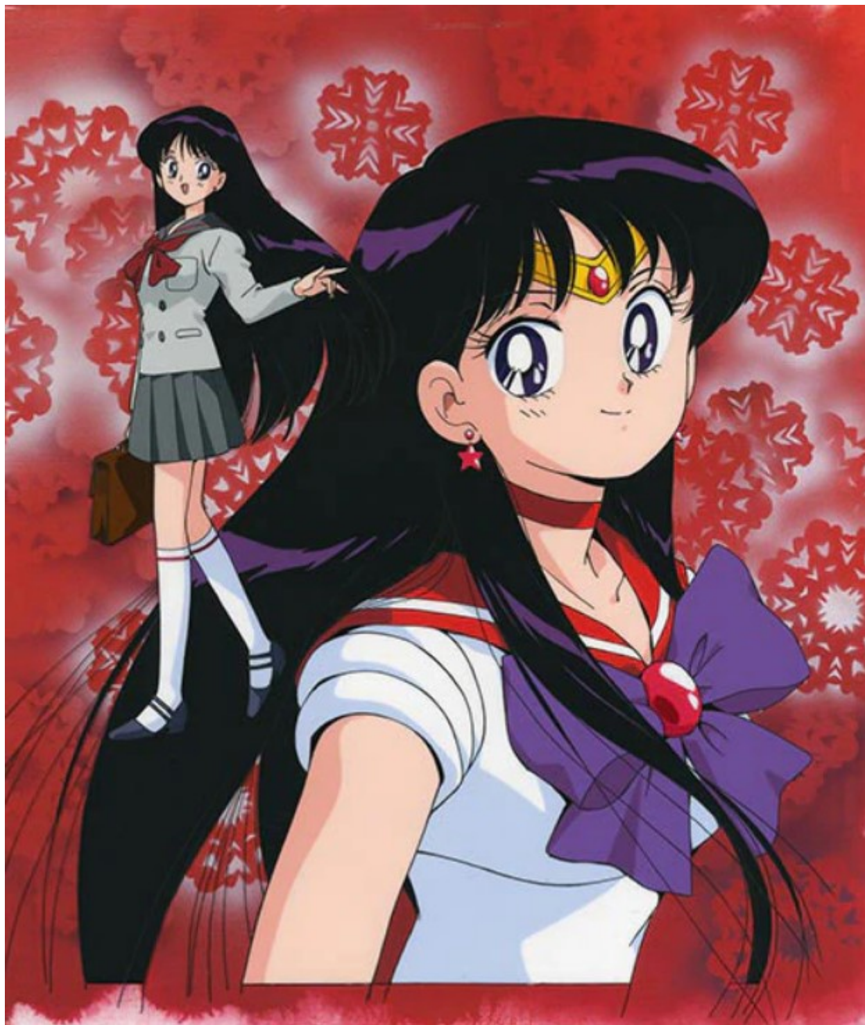
Sailor Mars / Rei Hanken