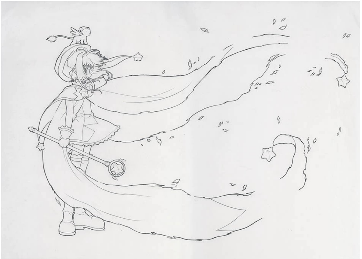
Card Captor Sakura Hanken Douga