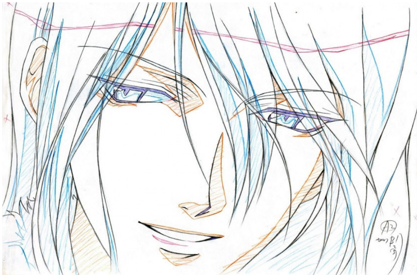
A genga of Agamatsu Soubi from Loveless (episode 1). Loveless was digitally animated, but all of the sketch work was done on paper.