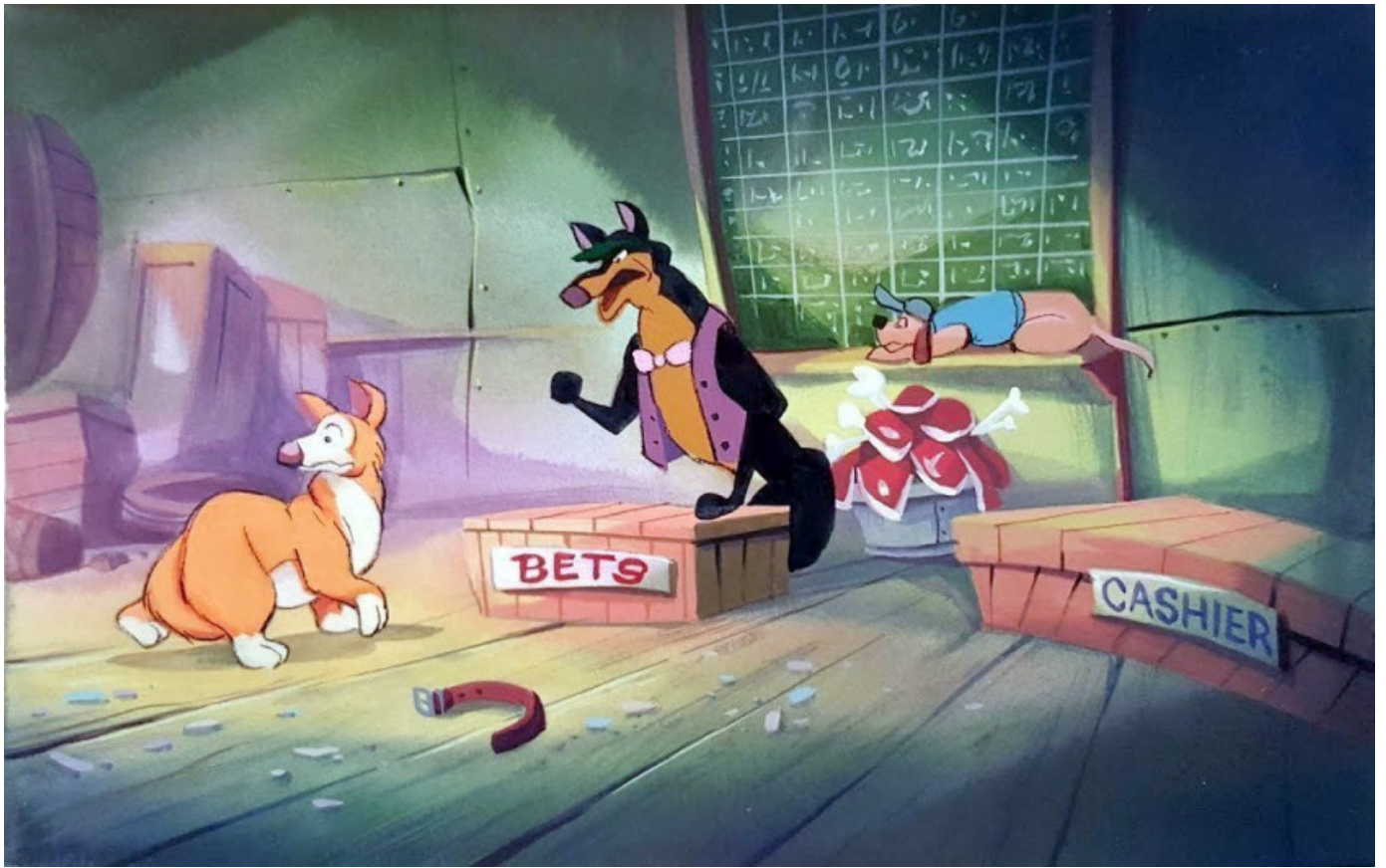
A scene color concept painting from All Dogs Go To Heaven.